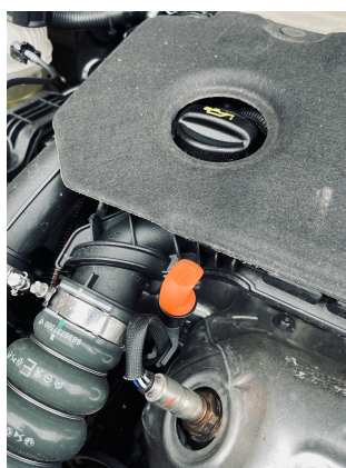
2. Engine Oil, pull out the dipstick when the engine has been off for a while, clean it with a clean rag, re-insert and pull out again to get a reading between the Min and Max line on the stick