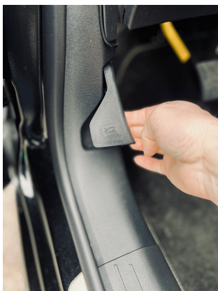
Open the hood catch located near front passenger door.