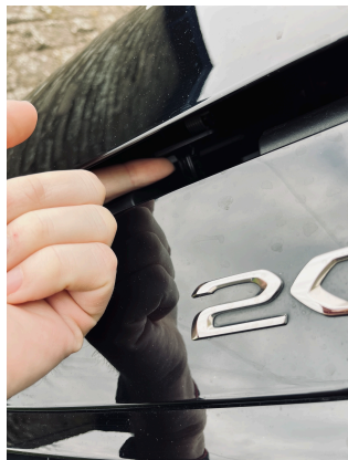
Then locate the secondary catch on the hood, helps if you crouch down and look for the gap to push your fingers in, the catch pushes upwards to release.