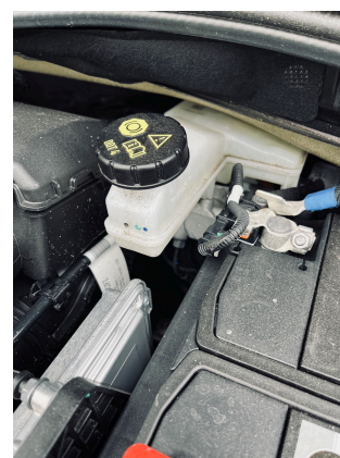
3. Brake Fluid, level must be within the Min and Max line visible on side of the bottle