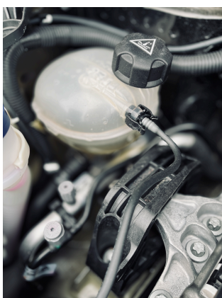
1. Engine Coolant, level must be within the Min and Max line visible on side of the bottle